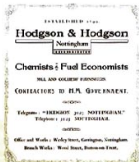
Hodgson & Hodgson - Chemists, Fuel Economists and Mill Furnishers